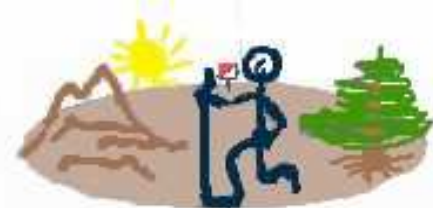
North Shore Adventure Club