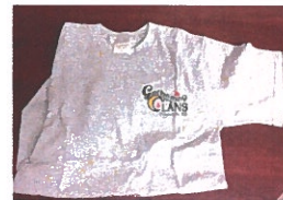
Gathering of the Clans shirt Small size only $20