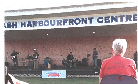
Derailed played the Pugwash Harbourfront Centre on August 15th

HarbourFest-Homecoming 2022, please contact us. We'd love to help your ideas come alive. Contact us at harbourfest1@gmail.com .