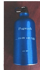
Collectable GOC water bottle $5