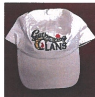
Gathering of the Clans hat $15