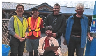
Pugwash Farmers' Market Volunteers - Community Protectors "making the market is a safe and happy experience"