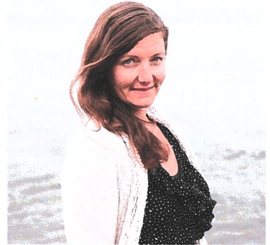
Supplied photo & press release