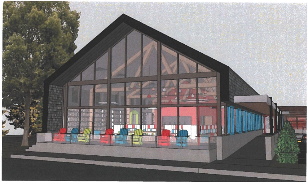
From the Pugwash Waterfront Development report released March 2018 by designers, A49

The next phase to construct a multi-purpose Centre in Pugwash is set to go ahead. Over several years the project has gone from initial meetings to a set of conceptual drawings to a series of public consultations, a more formal set of drawings to locating, purchase and preparation of the site and now to a detailed design and business plan.