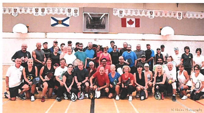
Pickleball tournament Group - Day 1.

comers, are taking advantage of outside play. The “First Annual Pugwash Pickleball Fall Classic” tournament was at the High School on Sept 21 & 22. Many people attended, drawing many enthusiasts from neighbouring communities. Yes, pickleball is growing exponentially and has come to Pugwash!