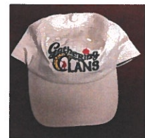
Gathering of the Clans hat $15