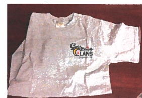
Gathering of the Clans shirt $20