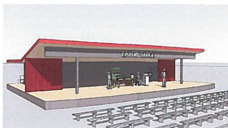
Architecture49 concept drawing of the new stage in Eaton Park

The full design drawings of the multipurpose centre, which includes a new library, an indoor walking track and moveable walls to suit every different kind of use and the new stage, are available for viewing on the Village website.