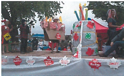
First Place, Non-Commercial: Countryview 4H