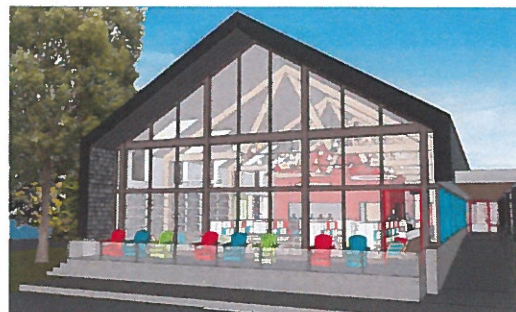
Architecture49 concept drawing of the library as seen from Durham Street

There was another well attended public consultation held by the consulting firm Architecture 49 on August 23rd. The concept drawings for street-scaping, Eaton Stage, and the Multi-Purpose Centre were presented. The plans were well received overall and attendees asked questions, voiced concerns, and made suggestions.