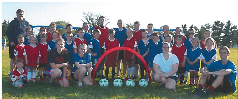
JumpStart Cumberland Soccer program 2017