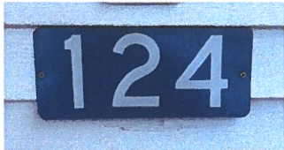
Pugwash Village Hall civic number

Could emergency services find your home or business? At night? In a snow storm?