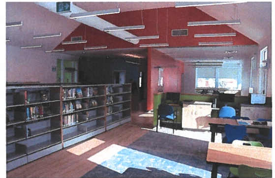
Main collections area with program room in the background.