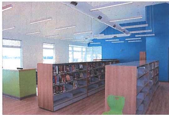
Library main collections area.