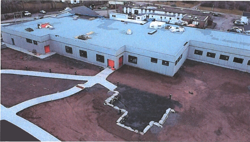
Recent aerial photo of the new health care centre. The exterior stonework is Wallace sandstone. Staff.

The clinical planning team is starting to transition from construction to operations and looks forward to welcoming patients and families.