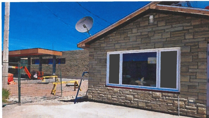
The new Emergency Health Services (EHS) building, pictured with the new North Cumberland Health Care Centre in the background, shows some of the completed stonework with sandstone from Wallace Quarries Ltd.

The project team is proud that Wallace Quarries Ltd., located in nearby Wallace, is supplying the sandstone being installed on the exterior walls near the entrance of the new facility. The stonework features a rockface finish with exposed and angled edges. Sandstone from Wallace Quarries has been used in the Nova Scotia Legislature, Parliament of Canada buildings, universities across Canada, and locally in the Joggins Fossil Centre and Halifax City Hall.