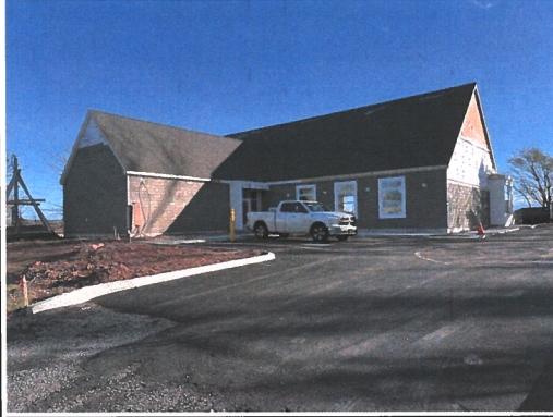
Exterior as seen from Durham Street (Staff)