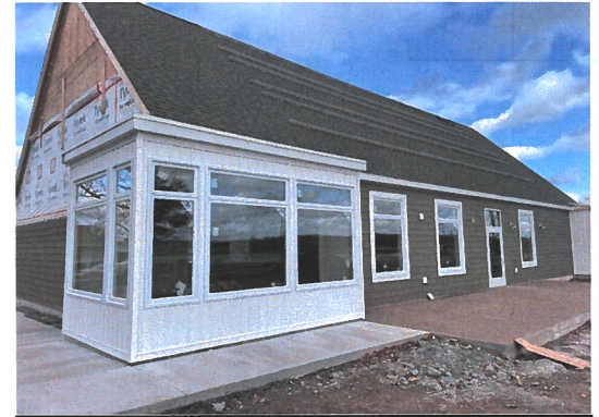
Exterior as seen from Pugwash Harbour (Cole)

The Library at the current location at the old CN train station will close on December 3rd. Until this beautiful new facility opens in January/February next year, the drop off box will remain at the train station location and Borrowing By Mail is available to anyone residing in Cumberland County. Your library card is valid for borrowing at any other library in the province. Please call 902 667 2549 for further information.