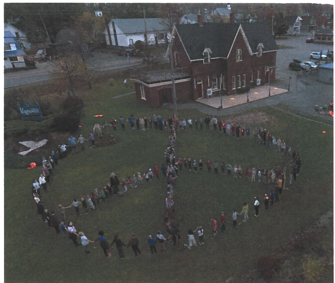
CEES students, teachers and community members join hands to make a giant peace sign. For more information, please see page 7