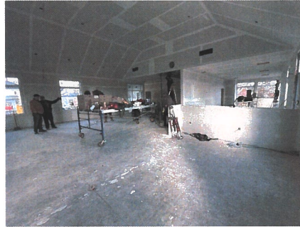
Interior is ready for paint, then flooring and trim. (Cole)

The Library at the current location at the old CN train station will close on December 3rd. Until this beautiful new facility opens in January/February next year, the drop off box will remain at the train station location and Borrowing By Mail is available to anyone residing in Cumberland County. Your library card is valid for borrowing at any other library in the province. Please call 902 667 2549 for further information.