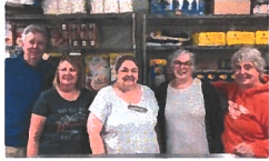
Open Hamper Food Bank Volunteers

Community Caretaker "lending a helping hand in her neighbourhood"