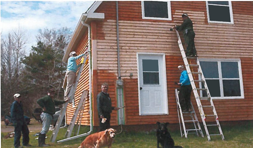
Staining has been completed on Estuary House. Thanks to all the volunteers for their time and energy.

On Tuesday, June 2 volunteers from the Friends combined with Nature Conservancy Canada to host a day of Biology/Science hands on activities for students from Pugwash District High School. Students learned how to recognize glossy buckthorn (and rip it out), the names of certain plants, bird calls, identify tree species and tell the age of a tree by coring. Due to the weather, the afternoon session on shoreline creatures was moved indoors.