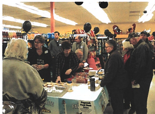
Busy scene at the Pugwash Co-Op on Johnny Cash Day, February 26th. Fried bologna sandwiches and cake were part of this annual fund raiser.

tion, there were many food donations made. Plus, a lot of people had a very nice lunch."