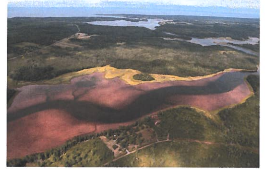
Pugwash Estuary, looking towards Northumberland Strait.

The Pugwash Estuary Nature Reserve is a popular destination for birders and nature lovers and is one of NCC's "Nature Destinations". The Nature Destinations program invites the public to explore some of the greatest exam-