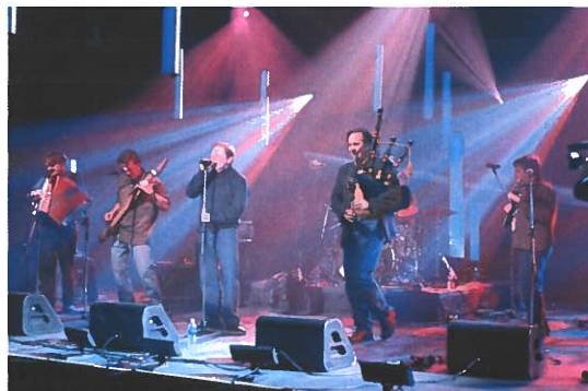
Rawlins Cross in Concert.

July 1st will be a rocking good time with Rawlins Cross christening the new stage in Eaton Park. The rest of the line-up is yet to be confirmed.