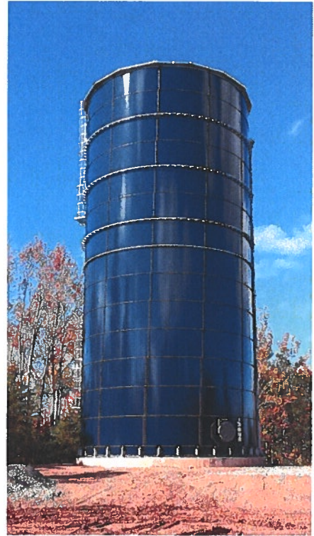
The Pugwash water reservoir is 60' high and has a capacity of one million litres or about three days' supply of water. It can be seen from the road at Port Phillip.